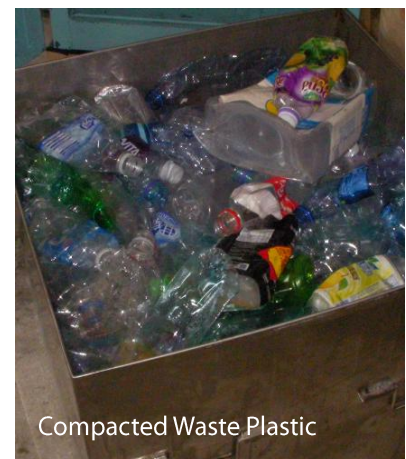
Compacted Waste Plastic